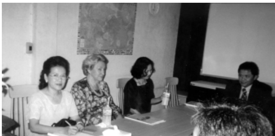
A Few Words of Encouragement from the Director of the National Cancer Institute of Thailand

for me to attend the opening ceremony of the APOCP Training Center