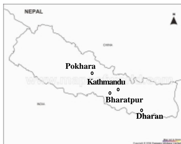
Figure 1. Outline Map of Nepal with the Sites of Contributing Hospitals

All hospitals provided data on individual cancer cases from January 1st to December 31st, 2005, with sex, age, occupation, religion, diagnosis and diagnostic methods and country districts for the patients. These data were then collected for the present descriptive study.