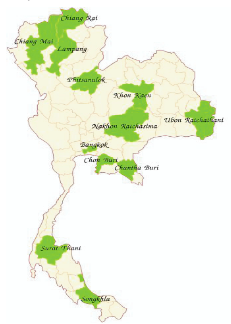
Figure 1. Collaborating Centers across Thailand

the coverage of childhood cancer diagnosis, questionnaires were sent to all hospital in the whole country. The result revealed that all cases of childhood cancer were referred to 18 centers included in the study. Cancer sites, morphology and behavior, were coded according to the ICD-0-3. The tumor types were grouped according to the International Childhood Cancer Classification (ICCC) (Kramarova, 1996). Both histologically verified and nonverified patients were included. The data were collected through a web-based registration under a standardized format, using double entry method under internal and external audit processes. All patients were observed until the end of December 2010. Aged-standardization rate (ASR) was performed using a direct method with groups 0-14 years (0-4, 5-9 and 10-14 years) (Parkin et al., 1998). ASRs were calculated by the direct method, using the world standard population and expressed per million person-years. Fiveyear cumulative survival rates were calculated using the Kaplan-Meier method.