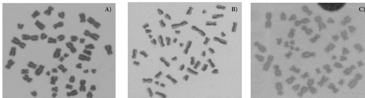
Figure 3. Homogeneous Densely Staining. A) MI, B) MII and C) MIII