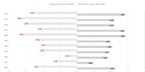
Figure 3. Incidence Rates of Colorectal Cancer in Kerman Province by Sex, 2003-2013