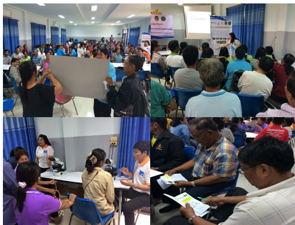
Figure 2. Group Process and Health Intervention Program Through VDO Clip of Moving Adult Worm and Story of Patient who Infected with Liver Fluke and CCA, Poster Presentation of Life Cycle of Liver Fluke, Demonstration of adult Worm and Egg of Liver Fluke Using Microscopy, and Brochure of liver Fluke Information

A total of 100 participants was included in this study. The majorities of participants were female (73.00%), age group 46-55 years old (48.00%), primary school (92.00%), marriage (91.00%), agriculture (99.00%), income 5,001-15,000 bah/month (36.00%) (Table 1). Participants had received information about liver fluke