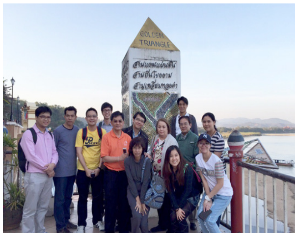
Figure 1. Endoscopy Team in Golden Triangle H. pylori Community Survey

The E-test was successfully done to demonstrate minimum inhibitory concentrations (MICs) of