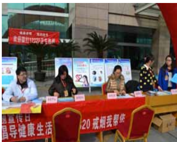
Public Propagating Activity