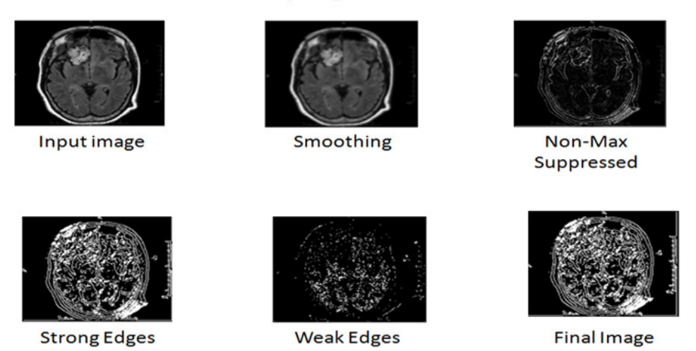
Figure 2. Spreading Area of the Tumor