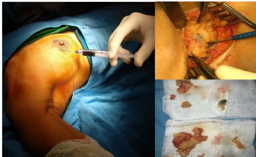
Figure 1. SLNB Procedure from Yarso KY, MD. Ph.D