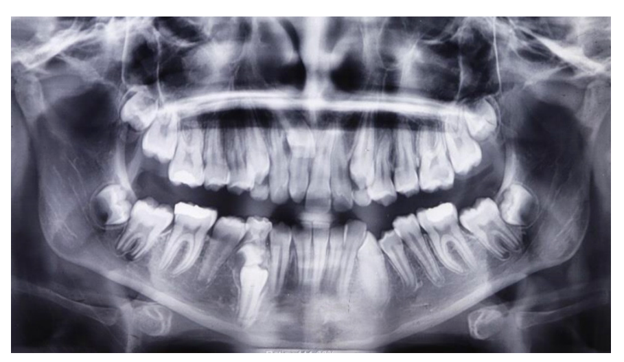
Figure 1. Radiographic View. Panoramic view of the lesion shows admixed lesion in pericoronal area at unerupted right mandibular first premolar tooth.