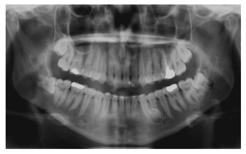
Figure 4. Follow up of the Patient. Tooth eruption and bone formation without any evidence of recurrence.

measuring 1\times0.6\times0.2 cm and a separate piece of creamy hard tissue measuring 0.5\times0.5\times0.5 cm. Cut section reveals solid, creamy, homogenous surface in both pieces.