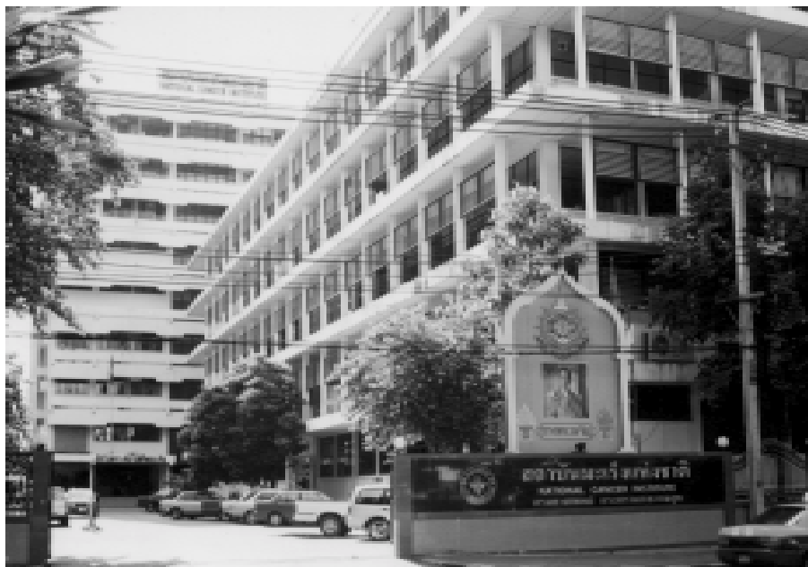
National Cancer Institute of Thailand

Together with the efforts of the clinicians in their twin roles as diagnosticians and cancer therapists, the members of the different research groups, both within the central facility and the outlying centres are dedicated to developing new approaches to the flight against cancer. Their co-operation in primary and secondary prevention deserves particular support and commendation from the APJCP!