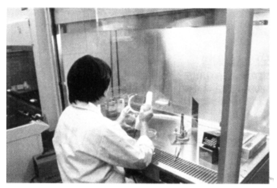
Cell Culture Facility