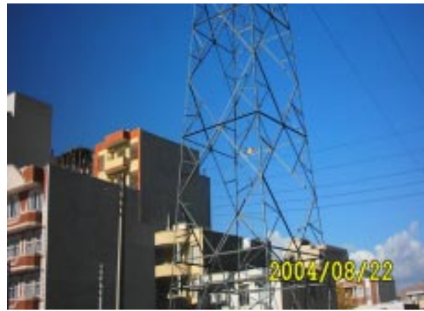
Figure 1. Very high voltage ;123 kilo-volt, Power Line

was considerably high (OR = 3.60) in this study.