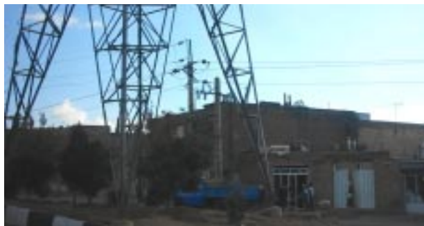
Figure 2: Very high voltage, 123 Kilo Volts, Power Line

increased risk of Acute Lymphoblastic Leukemia in children, living In the vicinity of very high voltage (123 & 230 kilo volts) power lines in distances \leq 500 meters, and in MF intensities > 0.45\mu\text{T} . It also seems that children in a developing country, like Iran, do experience more intensive MF effects than children in developed countries.