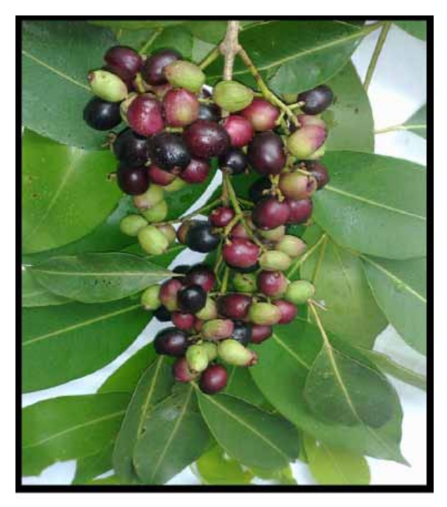
Figure 1. Appearance of Jamun Fruits

Jamun is an evergreen tree belonging to the family