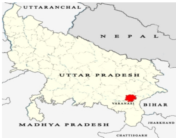
Figure 2. Map of Uttar Pradesh

ultimately completed the prescribed treatment. 300/370 (81.08%) patients had attended post treatment follow-up at the Radiotherapy OPD at the time of analysis. Among 847 males, 662 (78.15%) could be planned for treatment after they had undergone the staging investigations as advised to them. Though 387/662 (58.45%) started the treatment process, only 246/387 (63.56%) completed the planned treatment. 195/246 (50.38%) patients had attended post treatment follow up at the time of analysis (Table 4).