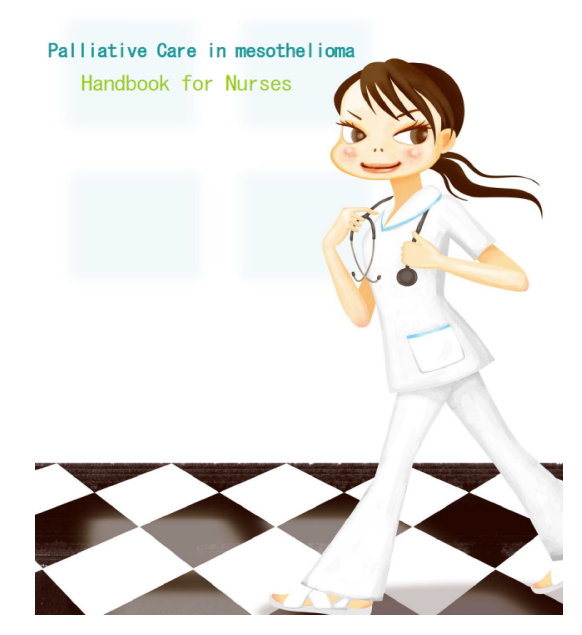
Figure 1. Cover of the Handbook

Development of the palliative care for MPM handbook As indicated by participants' comments, there were