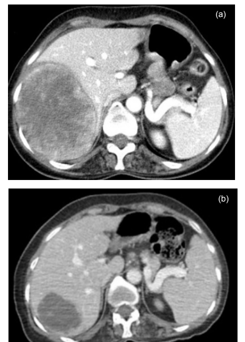
Figure 1. Axial CT. a) after IV contrast material in the right liver lobe marked contrast enhancing 123x90 mm solid mass lesion (initial AFP level 140080 ng/ml); b), 45x37 mm cystic solid mass lesion (4 weeks after treatment, AFP 1000 ng / ml)

A consistency was detected between the radiological and AFP marker responses in 16 of the 17 patients evaluated in this study. Only one patient had a partial AFP marker response despite a stable disease upon radiological examination. On the other hand, CEA marker response evaluation has shown a consistency with the radiological response of 12, but not in five patients. A stable CEA marker response was observed in four patients with partial response and one patient with progression upon radiological evaluation. Consistency rates of marker and radiologic responses are displayed in Table 3.