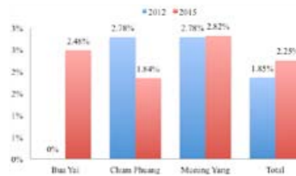
Figure 3. O. viverrini infection in 3 districts of Nakhon Ratchasima province, Thailand between 2012 and 2015