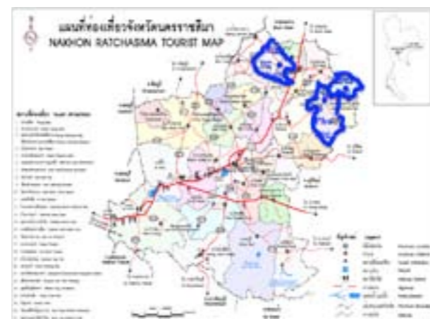
Figure 1. Map of Nakhon Ratchasima province, Northeastern Thailand; blue color lines are 3 districts of study areas including Bua Yai, Mueang Yang, and Chum Phuang

Multi-stage sampling was used to select the participants in this studied. Briefly, total of 66,163 populations from 194,152 populations was selected with criteria of aged ≥30 years old. Populations at risk were screened by using mini-verbal screening questionnaire contained the history with (1) opisthorchiasis; definitive diagnosed by medical doctor or related officers, (2) under-cooked fish consumption, (3) praziquantel used; given by medical doctor or related officers, (4) cholecystitis; definitive diagnosed by medical doctor or related officers, (5) relative family with