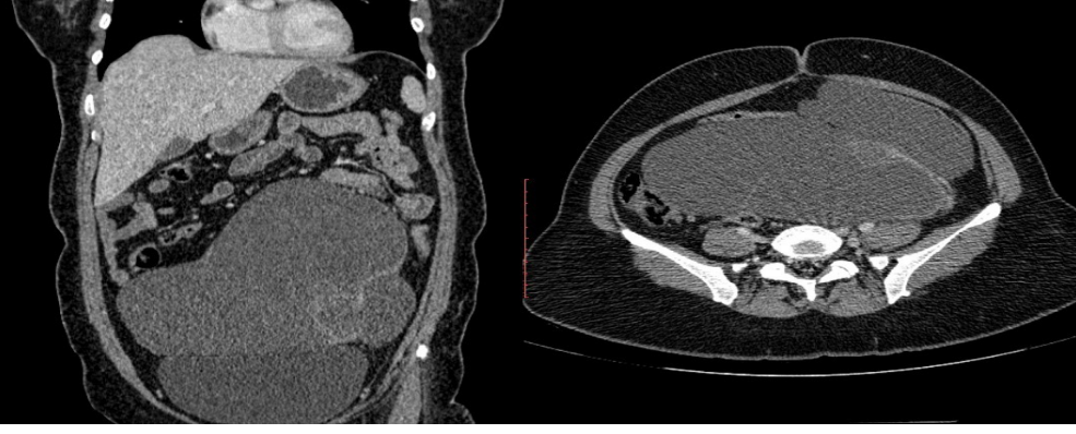
Figure 1. A 43 yrs Old Female Patient, Axial and Coronal CT Pelvis with Contrast Images Showing Heterogenoulsy Enhancing Lesion in Bilateral Adnexal Region Insparable from Both Ovaries with Few Interal Septation and Enhancing Soft Tissue Component more in Favour of Ovarian Neoplastic Lesion

A total of 158 patients were included in the study. Most of the patients 103 (65.2%) were \leq 45 years of age while remaining 55 (34.8%) were \geq 45 years of age (Mean age 42.67 ±10.30 years, range 30-60 years). Similarly, duration of symptoms of majority 88 (55.7%) were \leq 4 months while 70 (44.3%) were presented with \geq 4 months