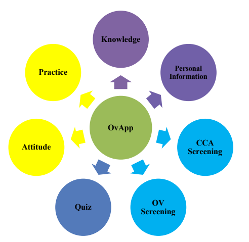
Figure 1. The Modules of Mobile Application (OvApp) for Screening the Risk Group of O. viverrini Infection was Developed for iOS and Android Platforms.

The populations at risk for O. viverrini infection were classified into varying risk and no risk groups;