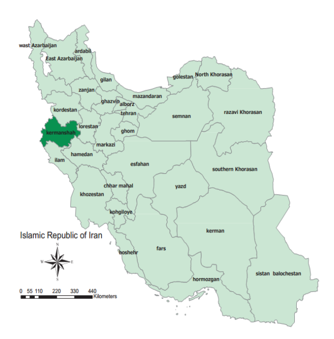
Figure1. Location of Kermanshah Province in Iran

(urban or rural areas), inasmuch as the incidence was remarkably higher in rural areas.