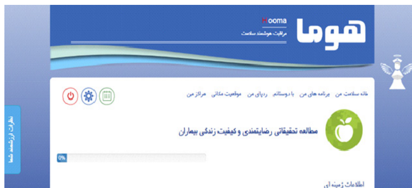
Figure 1. A Screen Shot of the Starting Page of the Web Site

We evaluated QoL based on tumor site and treatment modalities and found that women with gynecological cancer suffer from a relatively poor quality of life. Modern management of cancer in addition to patients'