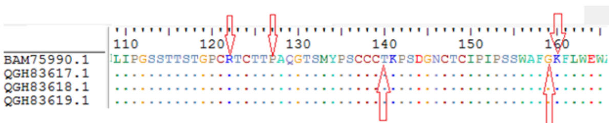
Figure 1. Shows the Amino Acid Position at 122R + 127P + 140T, 145G, 159G and 160K of Surface (S) Gene of the Three Isolated HBV Genome in Ahvaz City which Compared with Consensus Reference (BAM75990.1). All three isolates recognized as HBV subtype ayw2.

The chronic Systemic lupus erythematosus (SLE) may result in organ dysfunction over time (Francis and Perl, 2010; Tsokos, 2011). The SLE patients with HBV markers are at risk of HBV reactivation, which may lead to high morbidity and mortality rates since SLE patients need corticosteroid and immunosuppressive drugs treatment during the course of the disease (Lin et al., 2018; Kuo