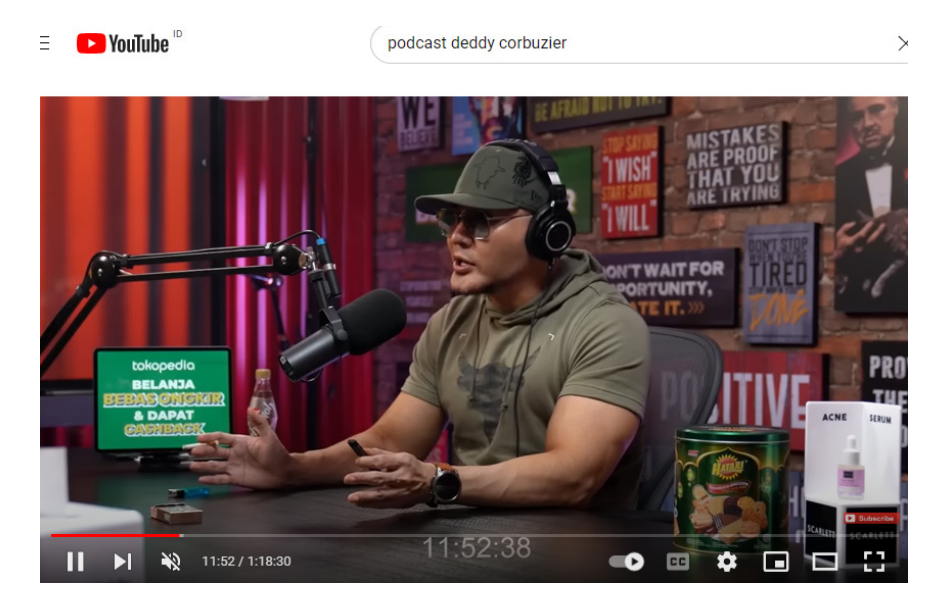
Figure 1. Cigarette Marketing Content on YouTube

This research aims to analyze the influence of new cigarette marketing strategies on social media in the form of content marketing on the smoking behavior of students in North Sumatra. This objective will be explained by finding answers to three main research topics, namely (a) analyzing the influence of content marketing in forming