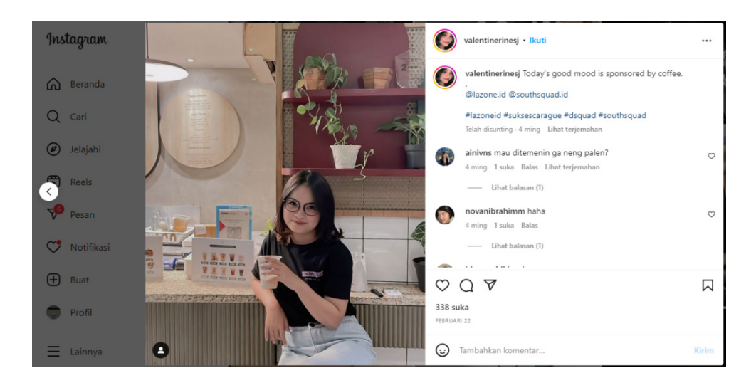
Figure 2. Cigarette Marketing Content on Instagram 1884 Asian Pacific Journal of Cancer Prevention, Vol 25