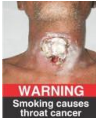
Specified warning for bidis