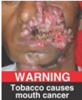
Specified warning for SLT